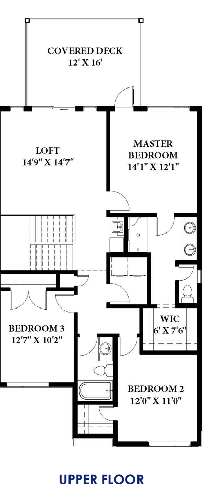
1,200 sq. ft.